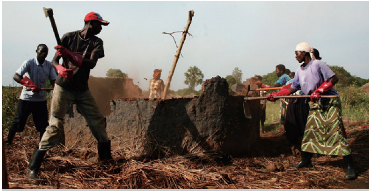
In preparation for camp closure, residents of Itubara Camp in Uganda begin decommissioning activities / UMHCR/ E. Denholm/ 2007

reflect the landscape and livelihood activities. In planning this may be reflected through specific measures such as tree planting, proper decommissioning of latrines and the provision of a site plan to the land owners to ensure that water points are not installed near former toilet pits. Neighbours may be requested to restrict access to the area for a defined period of time to decrease potential public health hazards.