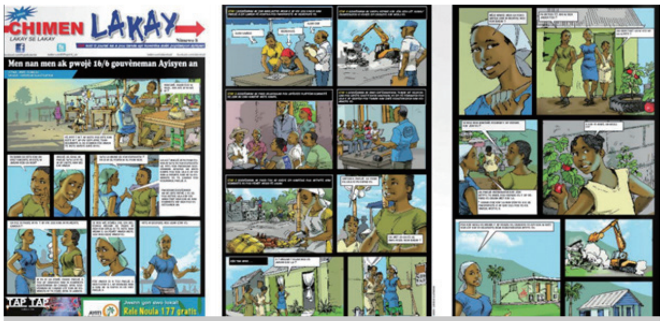
Comic based newspaper conveys message on the camp closure program/ Haiti/ IOM/2010

as camp buildings, according to agreements with host communities and local authorities governing their future intended use.